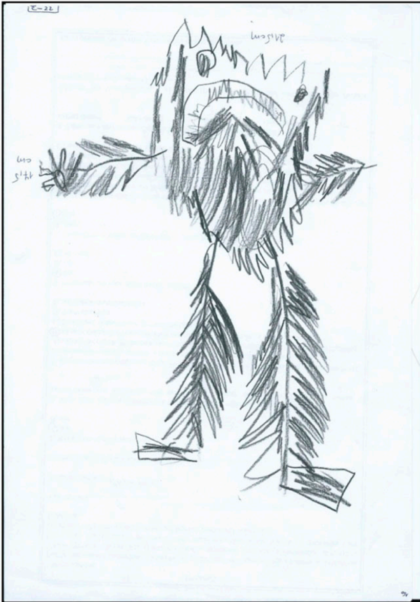
Figure 2. Uni-coloured (dark) drawing of a micro-organism