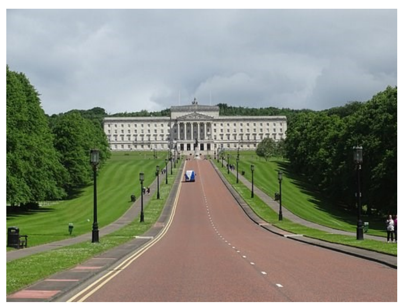
Parliament Buildings – Stormont Estate Belfast.