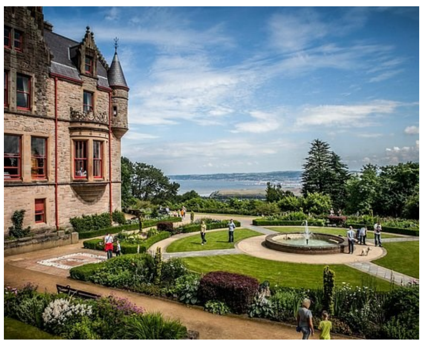
Afternoon Tea at Belfast Castle