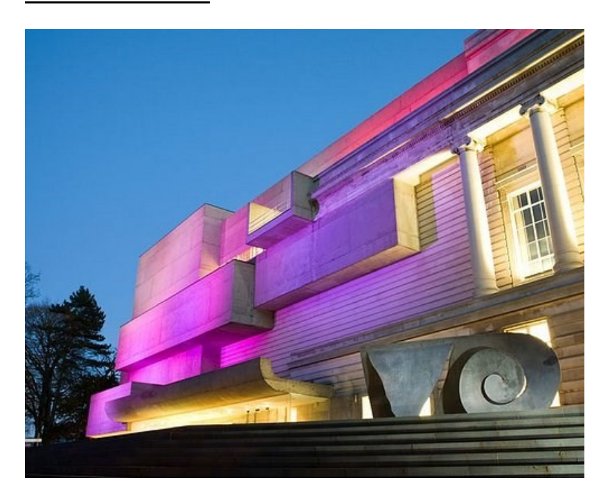
<u>Ulster Museum – Set in the Botanic Gardens beside Queens University , this is</u> a wonderful museum with amazing exhibits .