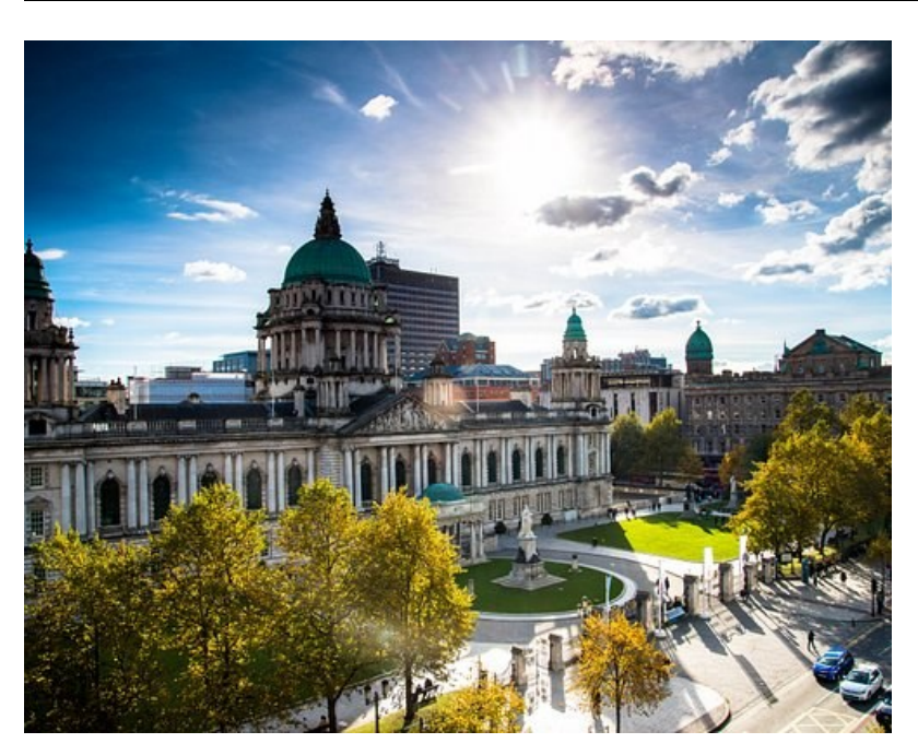
Belfast City Hall – <u>Great free tour and during Christmas the atmosphere and</u> Christmas decoration really make the place magical