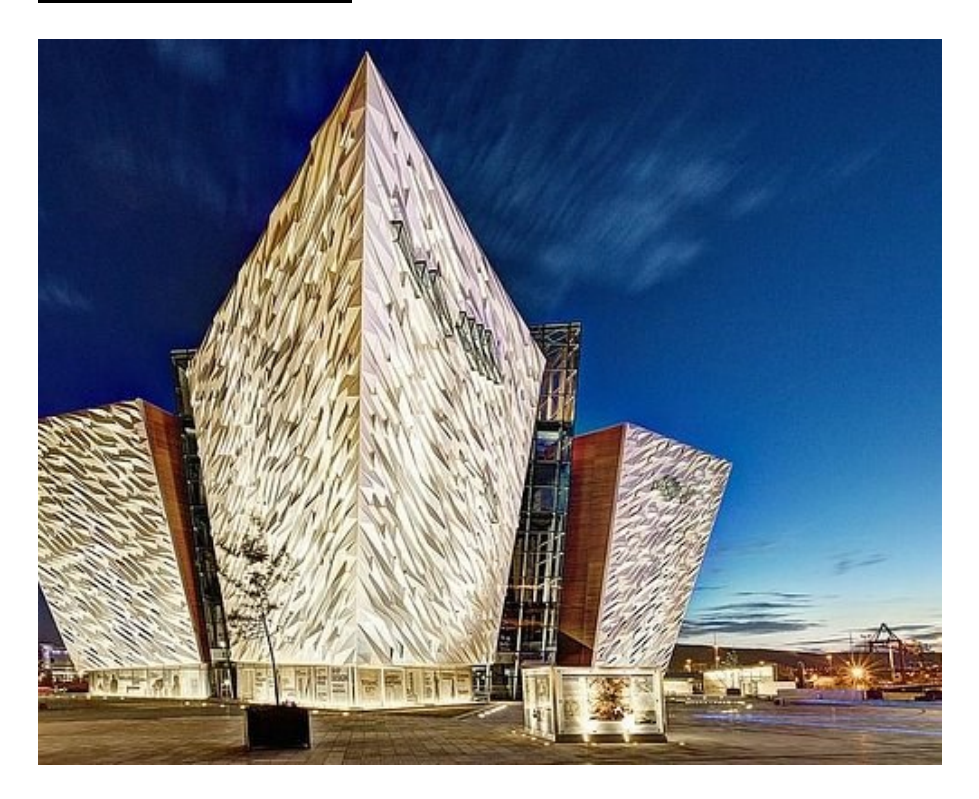
Titanic Belfast Museum