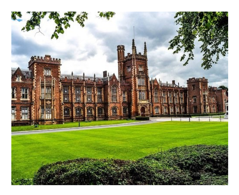
Queens University Belfast