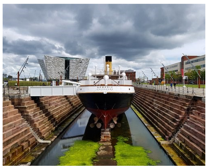
SS Nomadic Belfast