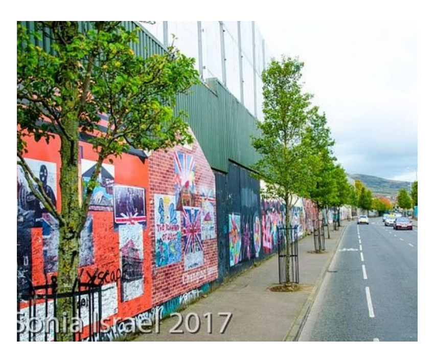
Peace Wall Murals