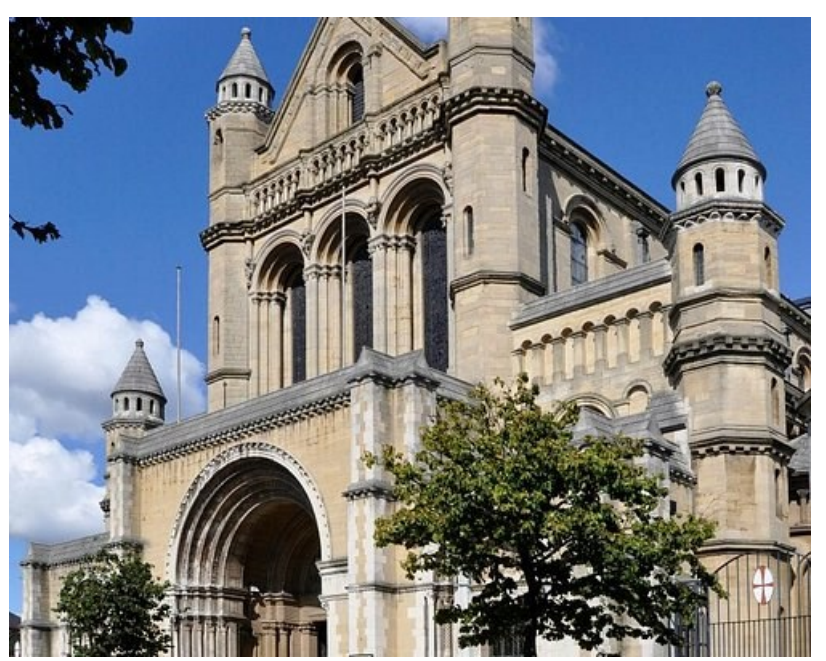
St Anne's which has so much history and interesting stories related to the stained glass windows, plaques etc.