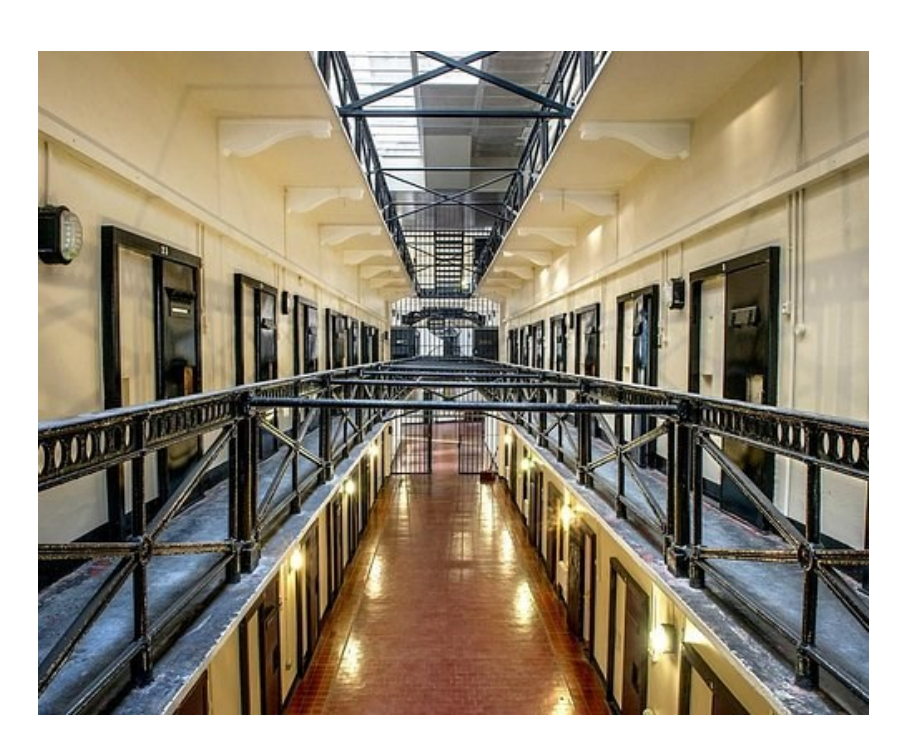
Crumlin Road Gaol