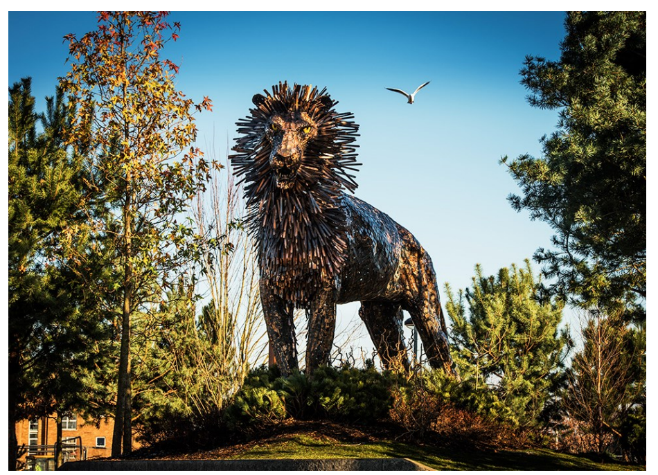
Aslan keeping watch over CS Lewis Square in Belfast

The city's most famous literary son – Chronicles of Narnia author CS Lewis – is said to have modelled parts of his fantasy world on Belfast's neighboring mountains of <u>Mourne</u>. Today his eponymous <u>city centre square</u> features seven bronze sculptures depicting characters from The Lion, The Witch and The Wardrobe . Snarling, spike-haired Aslan is clearly the mane attraction. Other places of interest include.