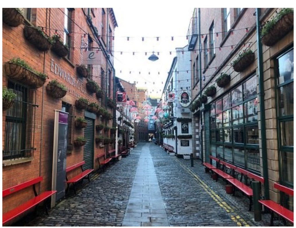
The Cathedral Quarter