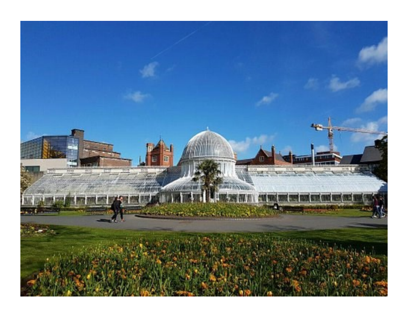
The botanical gardens include a really gorgeous rose garden containing a lot of different varieties arranged in conce...