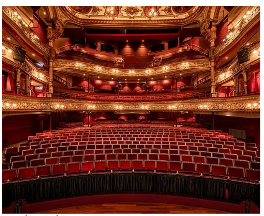
The Grand Opera House