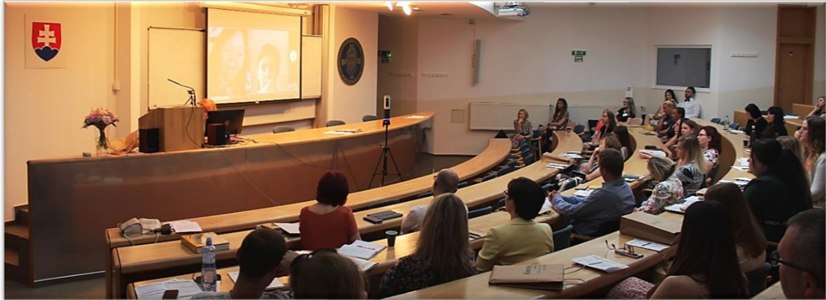
Figure 2: The conference took place shortly after the end of the pandemic measures in a hybrid form.

and Education (SPV), which has no analogue in Slovakia or in other European countries, thanks to the synergistic combination of the competences of pedagogical and professional staff in a single graduate profile. Social pedagogy is closely intertwined with leisure time pedagogy, which allows students to acquire more study competences for the performance of their future profession, e.g., to implement inclusion in the field of non-formal education.