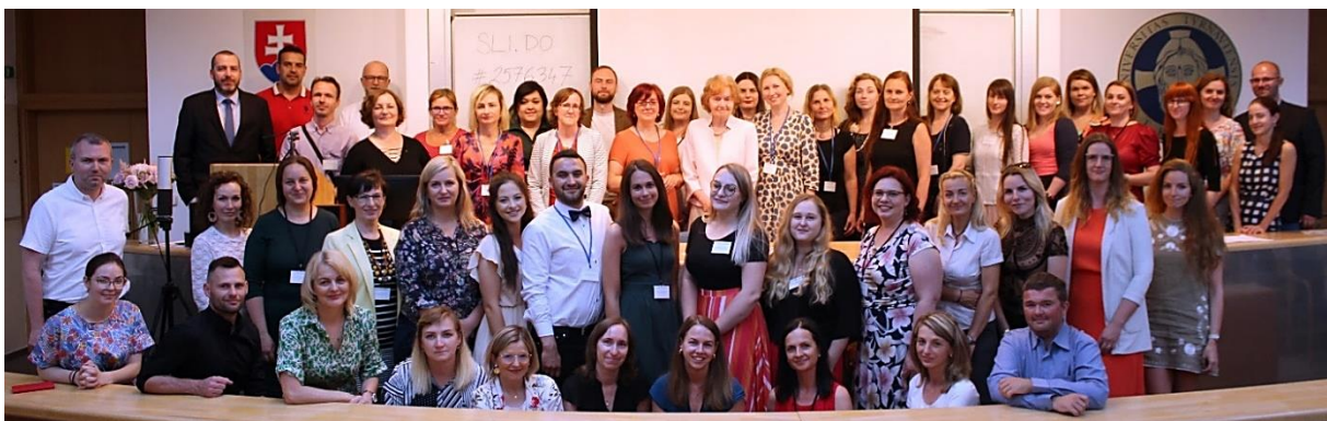
Figure 3: Conference participants – students, graduates, practitioners, educators.

The conference also created a platform for the exchange of experiences between representatives from the academic environment, with social pedagogues from practice and with the Research Institute of Child Psychology and Pathopsychology, with which the Department of Educational Studies signed a Memorandum of Cooperation in 2020. A significant proportion of the practitioners were the graduates of the SPV study programme who successfully progressed into various spheres of educational activity, e.g., as social pedagogues in schools, school counselling centres, and leisure centres, in the field of social protection of children in the Ministry of Labour, Social Affairs and Family, and in the municipal police.